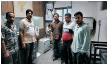
Inspection at Shimla Railway Station