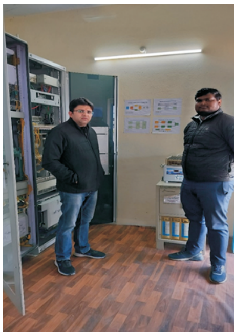
Inspection at Dausa PoP

with updated route diagram and network diagram. The patch cords were dressed up and routed properly and placed in the rack with labelling. Equipment Room was properly maintained at Dausa PoP. During inspection of Jaipur PoP on 08.01.2024, it was observed that equipment Room was properly maintained and dressed with labelling on patch chords. Updated Route diagram and network diagram were also present at Jaipur PoP. It was also observed that stock register for issuing the Duct/HDPE, OFC for rectifications of cuts and maintenance was prepared and properly maintained.