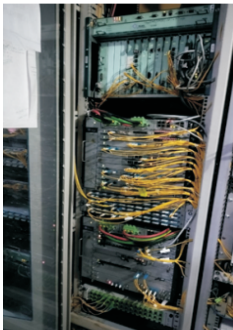
Inspection at Jaipur PoP