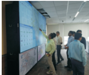
Inspection at CNOC Shastri Park