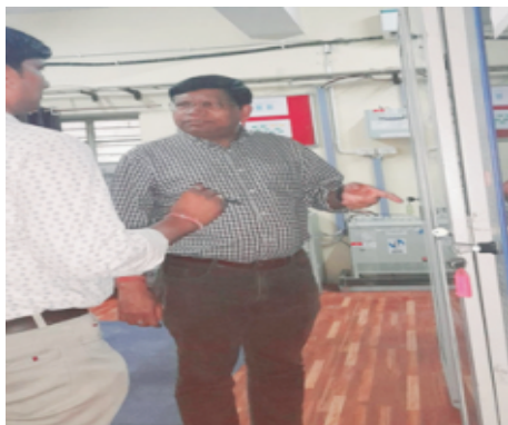
Inspection at Udaipur POP