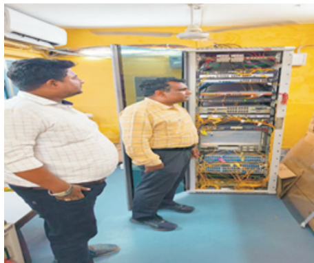
Inspection at Puri PoP