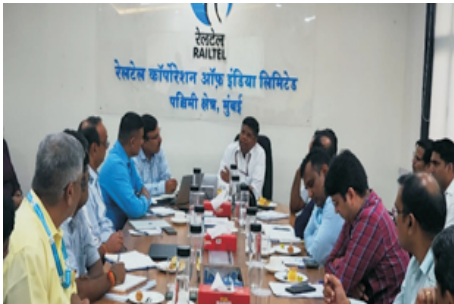
Vigilance Meeting in Western Region

Inspection of Kurla PoP (Mumbai): Vigilance inspection was carried out at Kurla PoP on 23.08.2024. The various types of equipments installed were Tejas TJ 1500 MUX, TJ 1600 MUX, D-Link 1G/10G Switch, TJ1100(STM-1), TJ1400(STM-64), D-Link (10G) Switch, D-Link(100G) Switch, 2 Juniper ACX2200 (10G) Router, 2 Juniper MX 204 Router, Coriant HIT 7090, Fibcom 6335, 4 ADVA3000 FSP, 4 ADVA40CSM for all 4 directions, Patch cords dressing found in proper manner. Four new 2-ton Split ACs were installed to maintain the temperature in Kurla PoP. Exide make 600 Ah single battery bank along with Exicom 200A Charger (Single DC Supply) was available. Date of Installation of Battery bank & Charger was 13.06.2022. Total load of Kurla PoP was approx. 61 amp only & AC supply availability approx. 100%. Overall, the ambience of the Kurla PoP was very good and room temperature was normal inside the PoP.