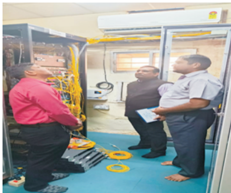
Inspection at Bhubaneswar PoP