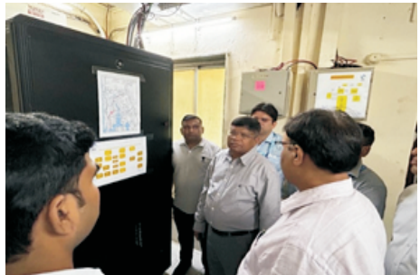
Inspection at Kurla PoP